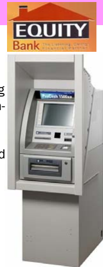
Wincor-Nixdorf ProCash 1500xe cash dispenser

The bank has in excess of 750,000 customers processing over 20,000 transactions per day on an EFT switching infrastructure deployed by TA