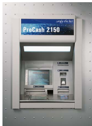
Wincor-Nixdorf ProCash 2150xe ATM with deposit functionality

Equity Bank Kenya awarded Technology Associates the largest single-largest ATM contract in East & Central Africa comprising of 100 Wincor-Nixdorf ATM's covering cash-dispensing and deposit functionality. With this rollout, the Equity ATM network will have 200 ATMs, all supplied and supported by Technology Associates. TA is proud to have played a key role in helping Equity implement its EFT payments platform on a turn-key basis and through a project we helped evolve since November 2003!