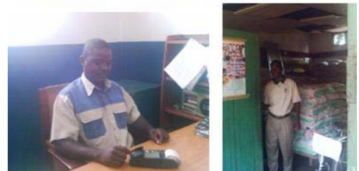
Managers at Agora and Farmers World stores respectively, demonstrating the use of the Makwacha card for payment for goods